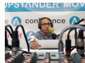
Mentoring sessions that will give you 100% confidence!

Level three is for ages 14-24 in High School, University, College or Technical College who have a desire to learn media reporting and basic principles of advanced mass Communications. Provided by award winning Master's in Communications. Provided by award winning Master's in Communications. Provided by award winning Master's in Communications. Provided by award winning Master's in Communications. Provided by award winning Master's in Communications. Provided by award winning Master's in Communications. Provided by award winning Master's in Communications.