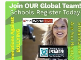
Join one of three levels of Streamcaster Students

Level one is for beginners ages 8-10 who have never had any form of training or tutoring in creating videos and audio streaming media. These Upstander students are the future advanced students of the bullying epidemic awareness networks intent to influence households with positive reinforcement of media with our Streamcasters reporting news we can all live with.