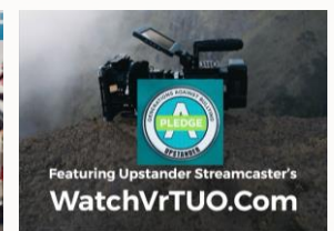
A Global Upstander Network Exclusive Opportunity!