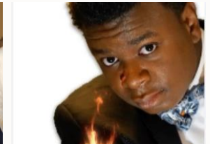
Special reports on Upstander Network Shows