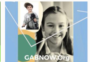
Boys & girls are encouraged to participate the same!